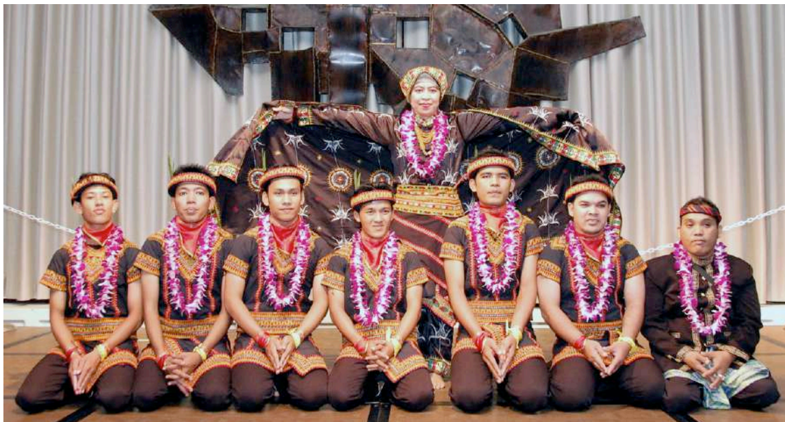
Aceh in Hawai'i The Aceh Experience and International Applications Conference invited a troupe of eighteen dancers from Aceh to Hawai'i to present traditional dances from the area of Sumatra devastated by the earthquake and tsunami of 2004.